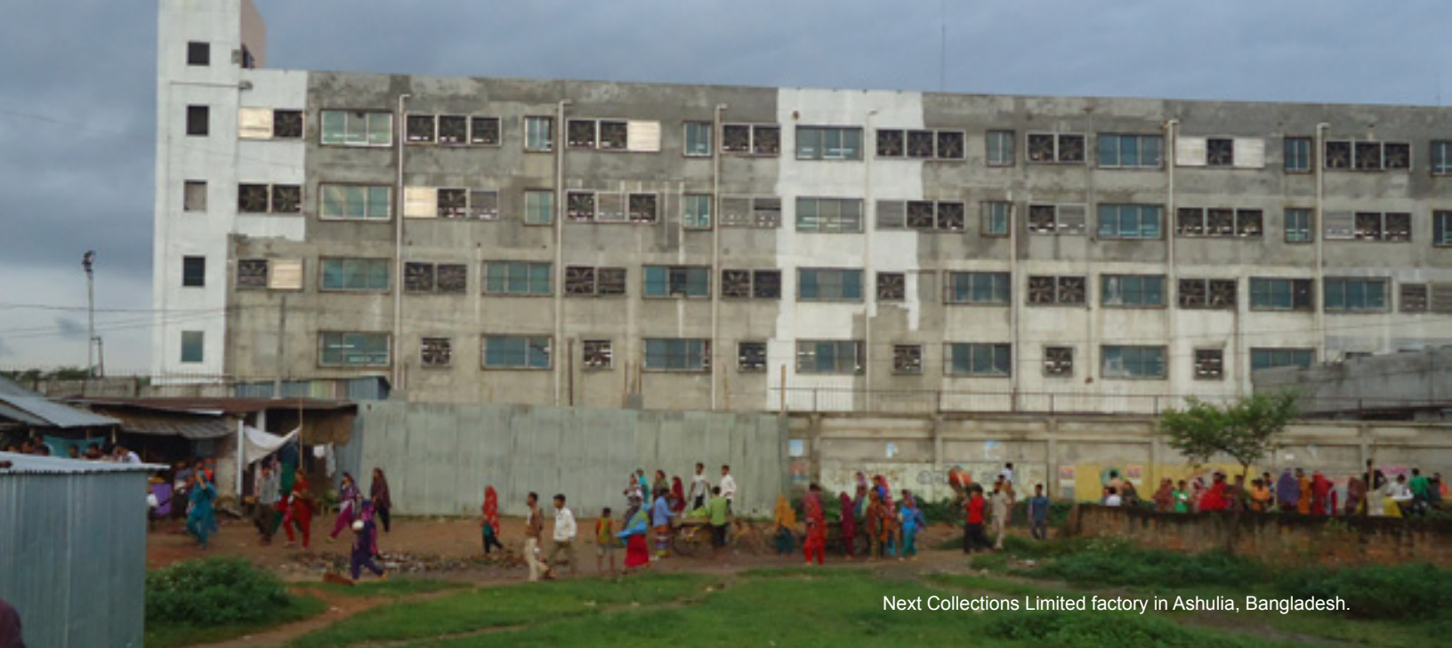
Next Collections Limited factory in Ashulia, Bangladesh.